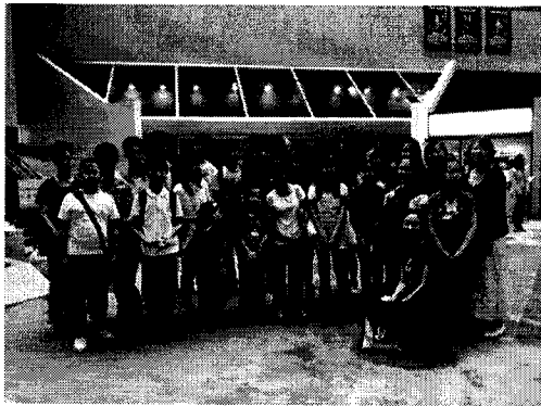
Our Group phase